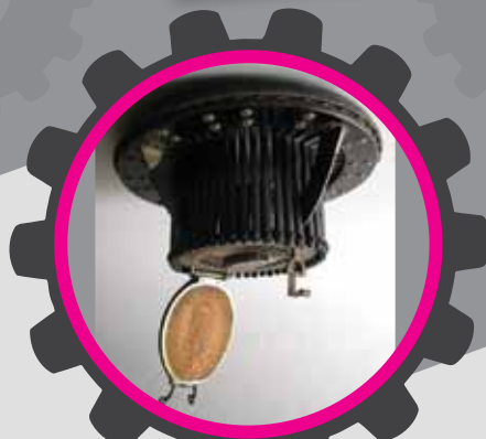
Shopping & Trading

Hat fitting device used to measure or conformateur customers' heads.