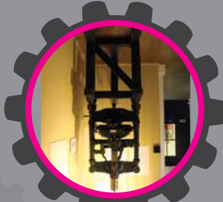
The Coffee Shop