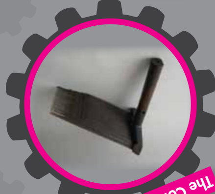
The Coffee Shop

Wool comb used to align the fibres before spinning.